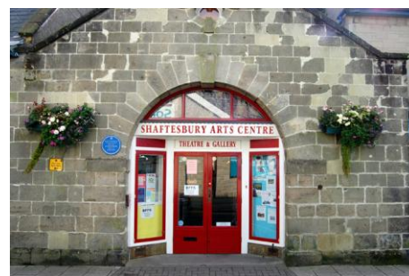
The 'new' Shaftesbury Arts Centre